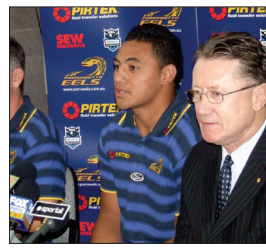
Re-signed and centre stage Page 31

WEEKENDER WEATHER Mostly Sunny: 17-31°C provided by www.itsfreepenrith.com.au Western Week-ender: Issue 346 Published by: The Western Weekender Pty Ltd Unit 1, 76 Sunnyholt Road, Blacktown TEL: 9831 4511 FAX: 9671 2203 Email: guardian@dial1.net